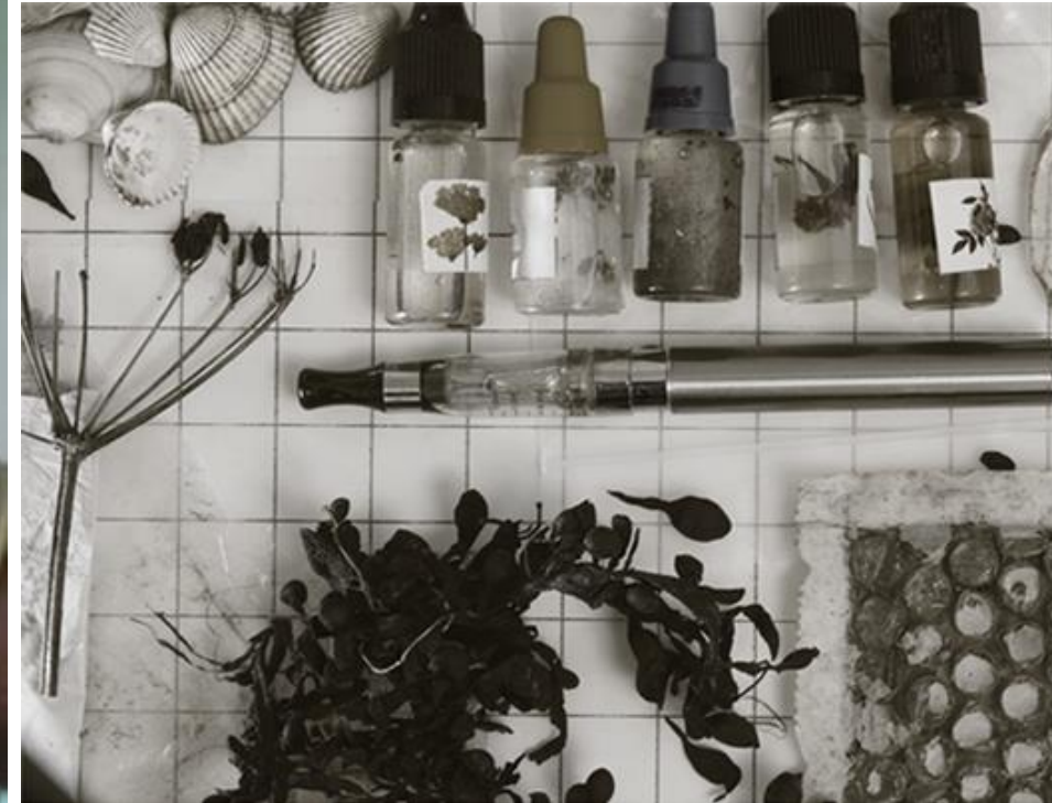
'Talking Dirty: Tongue First!' (2016)