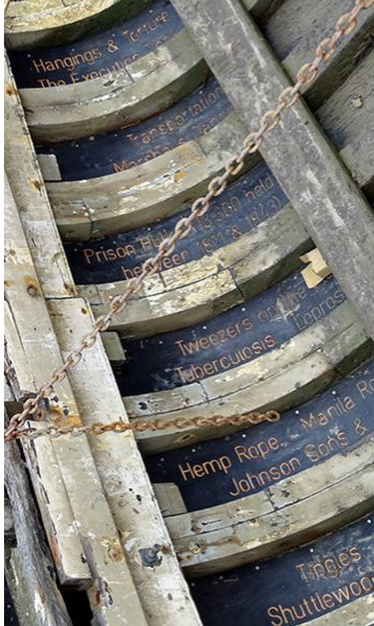
Graveyard of Lost Species (2016)